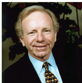
Sen. Joseph Lieberman

means of adjusting the postal workforce. It is also important to protect the Committee-adopted Moran Amendment that directs the USPS to establish fair retail service standards and prohibit