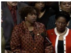
Rep. McKinney Apologizing

A Federal Grand Jury is reviewing a complaint against Rep. Cynthia McKinney (D-GA), alleging that she assaulted a U.S. Capitol Police Officer. Rep. McKinney struck the officer with her cell phone when he attempted to stop her from skirting a metal detector. Ordinarily, Members of Congress are able to avoid the security device. However, the officer on duty did not recognize McKinney. She had a new hairdo and she was not wearing her Congressional Pin. The Congresswoman, an African American, asserted that she was a victim of racial profiling and she should have been recognized. The incident took place on Wednesday, March 29. On Thursday, after considerable Congressional Black Caucus and Democratic Caucus pressure, McKinney apologized for her actions on the House floor.