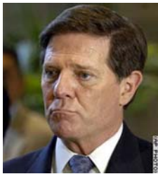
Rep. Delay Resigning

Former GOP House Majority Leader Tom Delay (R-TX) announced his intention to resign his congressional seat by mid-June. Though expected, the decision comes after a former high-ranking aide pleaded guilty to using Delay's Leadership office to promote a lobbying enterprise. The aide conducted the illegal activity while he was working on the congressman's staff. Consequently, the Majority Leader's office has been characterized as a "clearinghouse for scandal." Delay has been a lightning rod on Capitol Hill for many years. However, mounting legal and ethical problems, including a too-cozy relationship with former lobbyist Jack Abramoff, and serious doubts about his ability to defend his congressional seat against an aggressive campaign by former Rep. Nick Lampson convinced him to deny the voters the opportunity to vote him out of office. Delay chose to leave Congress, arguably, on his own terms. His decision to vacate the seat makes it more likely that his Republican leaning district will stay GOP.